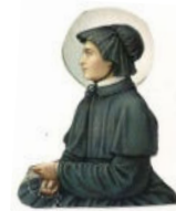
Court Mother Seton #2119

Perhaps you are living alone and not able to get out. Would you like someone to call or come by once a week to keep in touch? You may be facing surgery and don't know how you will get your medicines/groceries when you get home - or even who will change that light bulb in the ceiling. Maybe you are undergoing medical treatment and would really appreciate a home-cooked meal once or twice a week until you feel a bit more like yourself. Or perhaps you are in a difficult time and would simply like to ask for prayer support. Please consider allowing us to offer some Christian assistance. You may contact us by email at FISHministrySPN@gmail.com or call the Parish Office at 410-859-0571 and leave a message. Our goal is to be of service!